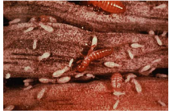
Termites Cause $5 Billion Damage Each Year